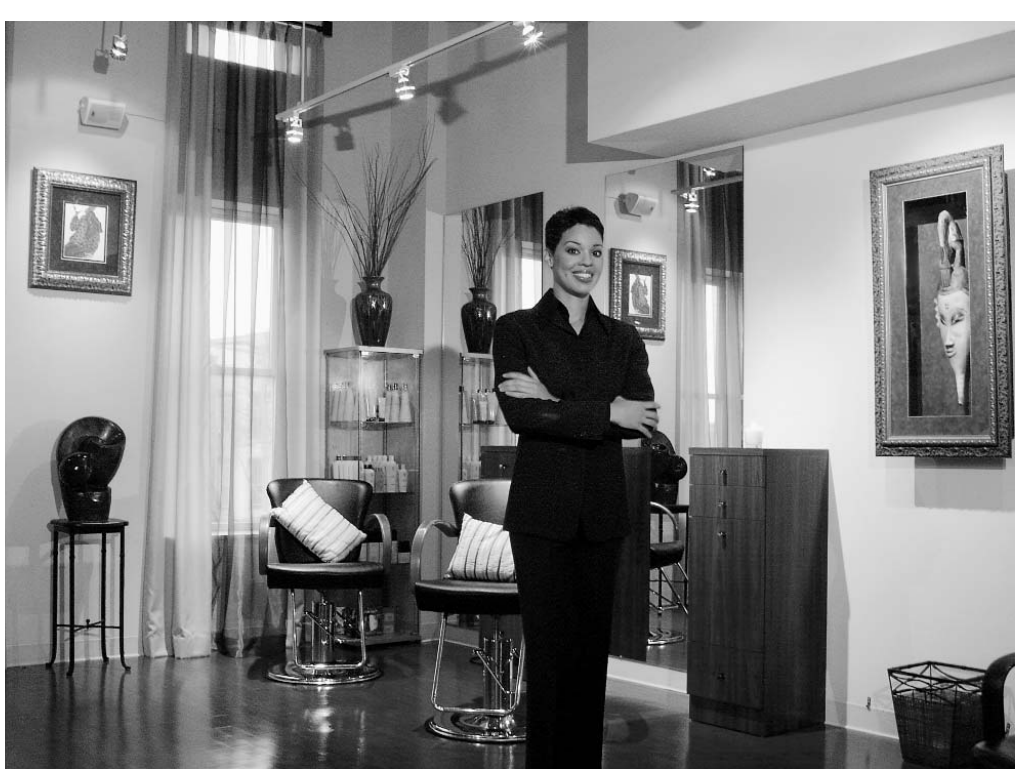
SOUL DAY SPA