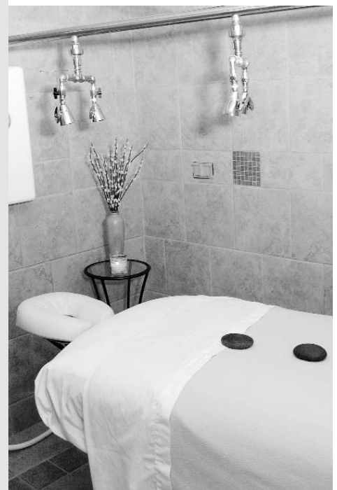
SOUL DAY SPA

Just reading about relaxation won't remove a knotty muscle or alleviate tuckered-out feet. Listed below are some Washington-area day spas located in and around the DIA conference area that can help you relax in between sessions or strolls around the exhibits.