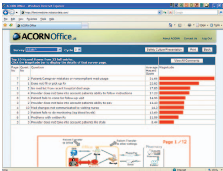
■ Figure 2. Example of SEMI-P Interactive Visualized Results

SEMI-P indicates Safety Enhancement and Monitoring Instrument that is Patient Centered.