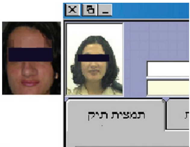
■ Figure 2. A Case of Hyperthyroidism

The picture on the right is the photograph as it appears in the medical records. The picture on the left is the photograph of the patient as she appears to the doctor's office.