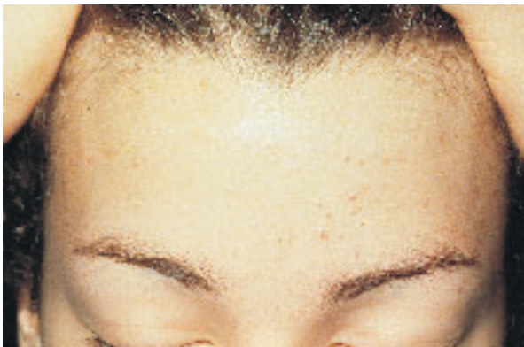
Figure 2. Papular Acne