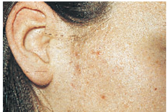
Figure 3. Papular Acne