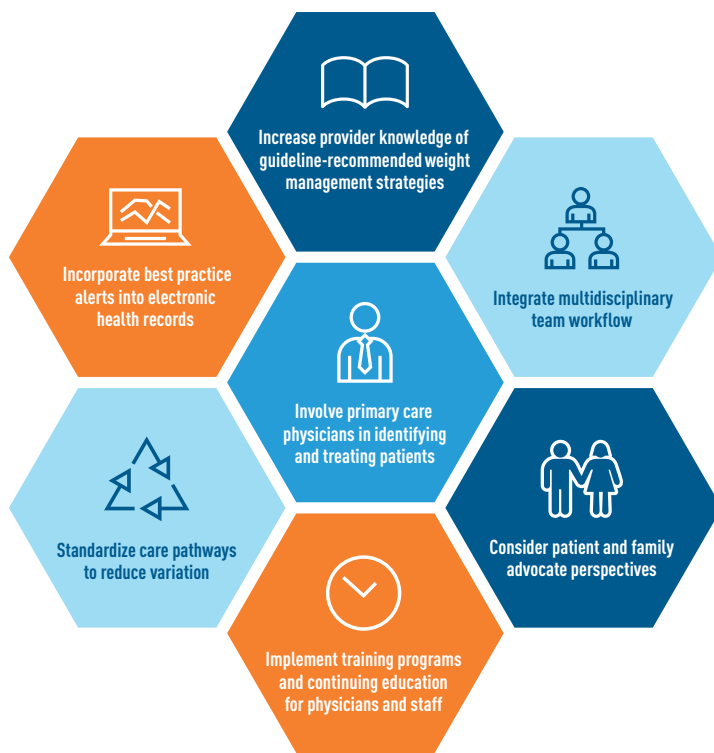
Figure 2. Considerations When Planning and Implementing Obesity Management Programs 37,38

patient views and outcomes. 36 General practitioners and multidisciplinary support teams can play a crucial role in helping patients achieve sustainable weight loss. 3,8,19,36,37