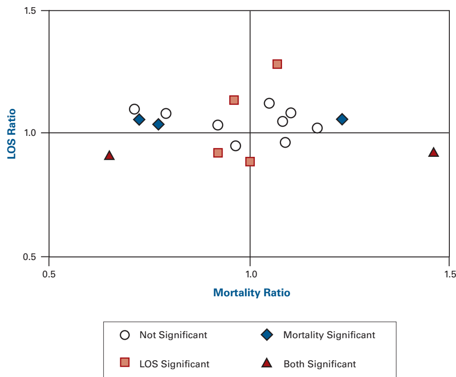
■ Figure 2. Abbreviated Fine Severity Score Risk-adjusted Performance Comparisons of 18 Northern California Kaiser Permanente Medical Care Program Hospitals

The X-axis plots a facility's risk-adjusted mortality ratio (observed-to-expected mortality) among all patients admitted with community-acquired pneumonia (CAP), while the Y-axis plots a facility's risk-adjusted length of stay (LOS) ratio (observed-to-expected LOS) among all surviving patients admitted with CAP. The key shows whether a given facility's mortality or LOS ratio is significantly different from 1.0.