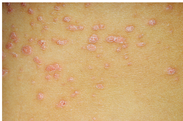
■ Figure 3. Guttate Psoriasis