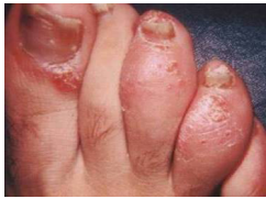
■ Figure 7. Dactylitis