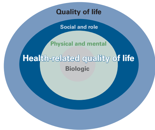
■ Figure 1. Quality of Life

Adapted with permission from Reference 4.