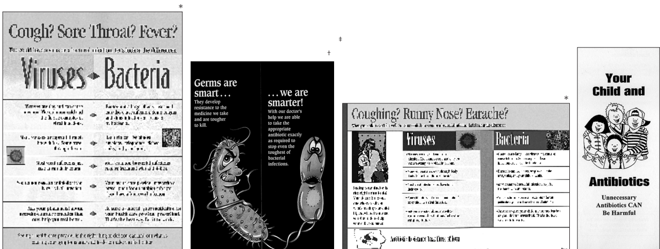
Figure 2. Materials Included in the Mailing to Healthcare Providers

*Posters provided by GlaxoSmithKline, Philadelphia, Pa. †Brochure provided by the Alliance for Prudent Use of Antibiotics. ‡Brochure produced by Iowa Antibiotic Resistance Task Force.