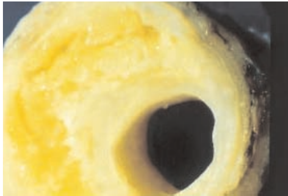
■ Figure. Stable Versus Unstable Plaque