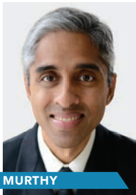
MURTHY Vivek Murthy, MD, MBA, was US Surgeon General, 2014-2017 and 2021-2015.

IN HIS FINAL WEEKS as US Surgeon General, Vivek Murthy, MD, MBA, sent out a call to action on January 3, 2025, for alcohol labels to now include cancer warnings, noting links to at least 7 cancer types. 1,2