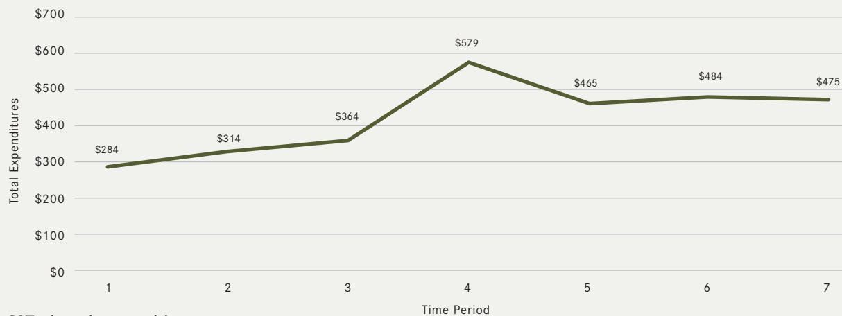
Figure. Difference in Average Total Expenditures (no prescription drug costs) Between COT and No COT Transition Using a Counterfactual Prediction Technique

Transitioning to COT can place a significant economic burden on payers and patients in terms of healthcare utilization and expenditures. Despite having similar baseline values to patients with acute opioid use, patients making the