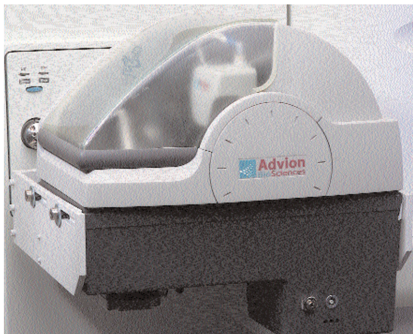
Advion's NanoMate 100 System combines automated sample handling and introduction with the company's proprietary electrospray ionization (ESI) chip to provide a hands-free, robust method for high-throughput sample analysis by nanoelectrospray mass spectrometry.

Skilled users manually perform sample introduction for nanoelectrospray by using