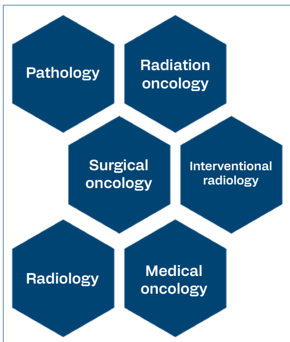
FIGURE 3. Specialists Involved in an MDT