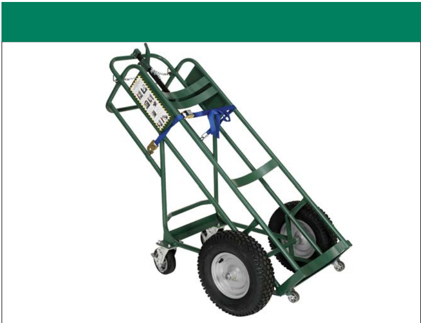
Figure 4: The proper way to move a cylinder is by using the appropriate gas cylinder cart. Always replace the cylinder cap before transport.

port lines to answer nonemergency technical questions, which is especially helpful during the set up of a laboratory.