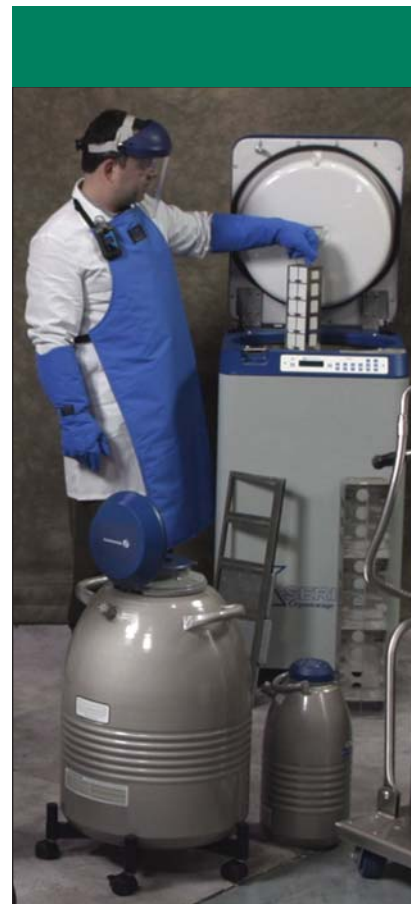
Figure 3: Laboratory workers who handle cryogens must wear insulated gloves, gowns, safety glasses, and face shields to prevent injury to the face and eyes.

Enforce the "dress code:" Require personnel to wear suitable protective clothing, including gloves, eye protection, and face protection. Keep in mind that a face shield alone is not adequate