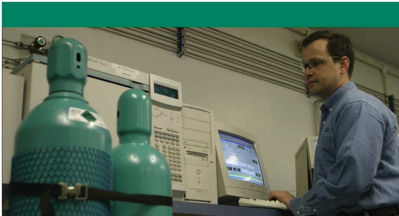
Figure 1: Make sure cylinders are secured properly at all times in a rack or with a chain, both in storage and at the laboratory workbench.

higher pressures of a gaseous supply adequately.