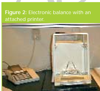
Figure 2: Electronic balance with an attached printer.