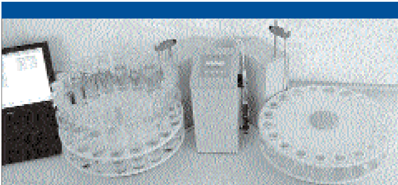
Figure 2: Device for the automatic preparation of liquid composite samples following strategic sample composition principles.

For Client Review Only. All Rights Reserved. Advanstar Communications Inc. 2003