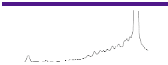
Figure 3: Detailed zoom-in of Figure 2. Note the separation of 20mer oligonucleotide from "failed" sequence contaminants.