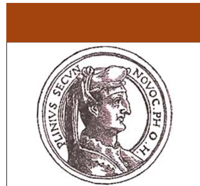
Figure 2: Pliny the Elder. An imaginative portrait from the Middle Ages.

exchange, thus, we might conclude that Moses used a kind of ion-exchange chromatography. It should, however, be men-