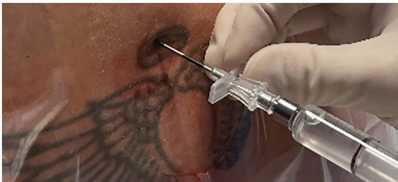
Figure 1. Sample image of an epidural placement with a 17-gauge Tuohy needle and attached glass syringe.

she began to complain of a severe headache. She described the headache as dull, throbbing, and significantly worse when she tried to walk around her room. She also felt nauseated and described experiencing double vision when she sat up. Additionally, she had severe neck pain and stiffness. Her symptoms were slightly improved by lying down. She complained of accompanying photophobia ( Figure 1 ).