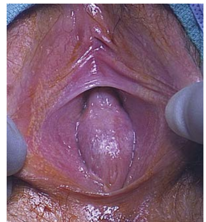
FIGURE 4. Imperforate hymen

and should potentially be diagnosed in the neonatal nursery, as maternal estrogen allows easy visualization of the vaginal introitus. If the neonate is asymptomatic and voiding without difficulty, surgical management can be deferred until puberty. More typical is a missed diagnosis until after menarche. Surgical incision of the hymen