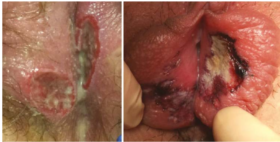
FIGURE 2. Aphthous or Lipschütz ulcers