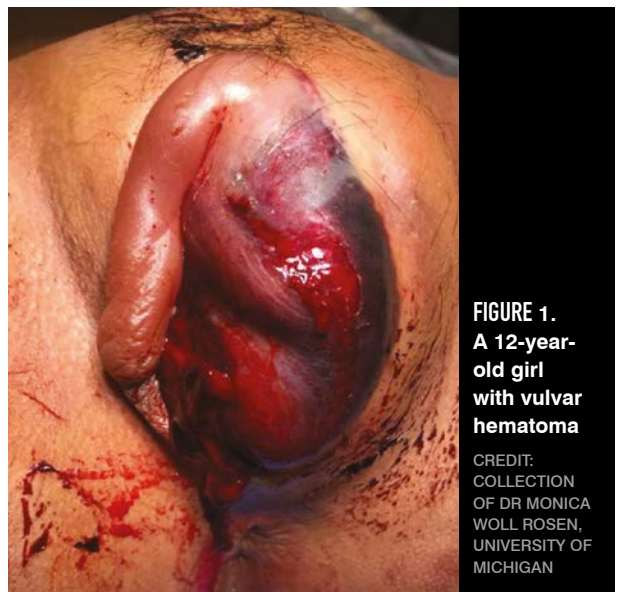
FIGURE 1. A 12-year-old girl with vulvar hematoma

A hematoma can be managed conservatively unless the hematoma is expanding, the skin is necrotic, or the patient is