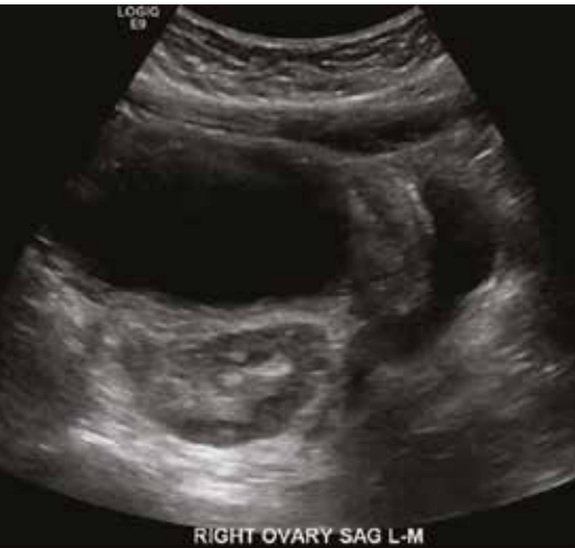
Peripheralization of follicles (hypoechoic rim) around the edematous stroma of the right ovary (outlined with dots). This patient had a right paratubal cyst and right adnexal torsion on laparoscopy. (Printed with patient permission)

appearing necrotic may continue to function, as measured by follicular development on ultrasound. 1 Concerns regarding the increased risk of venous thromboembolism with detorsion or infection if necrotic tissue is left in situ have not been substantiated. 1 Concern for malignancy is also often cited as a cause for oophorectomy, particularly in the pediatric population because at least 10% of pediatric ovarian masses are thought to be malignant. 15 However, a recent large study found only a 1.8% malignancy rate among pediatric patients with ovarian torsion. 15 A large multicenter study found that patients 10 years and younger (particularly those < 3 years old), those with public insurance, and those with chronic medical conditions were all more likely to undergo oophorectomy at the time of torsion, suggesting that many factors may play into surgical decision-making. 16