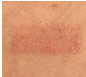
4 Days Post - Untreated

Test Patch at Max Setting (280 volt x 28 msec)