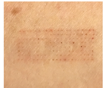
4 Days Post - Treated with AnteAGE MD® Growth Factor Solution