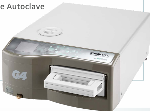
STATIM® G4 Cassette Autoclave

Pre-pandemic, OSHA cited a dental practice $61,000 for violations including worker exposure to bloodborne pathogens without an exposure control plan or proper training, lack of proper eye protection during use of chemicals to sanitize medical instruments, and inadequate personal protective equipment. The takeaway is not to guess, but rather, be sure of what OSHA's rules and regulations are as it applies to existing occupational hazards. For dentistry this includes exposure to bloodborne pathogens and coronavirus. So now the question is, how do we protect ourselves and prevent an OSHA inspection? Below, we'll explore an easy-to-implement safety concept that can be applied to any occupational threat.