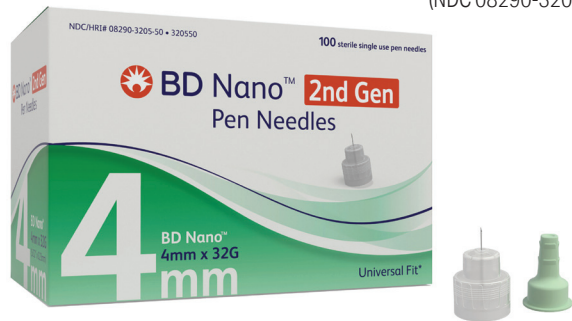
Figure 1. BD Nano™ 2nd Gen Pen Needles (4mm x 32G) (NDC 08290-3205-50)

The contoured base and overall design of BD Nano™ 2nd Gen Pen Needles is estimated to reduce the risk of IM injection vs comparator pen needles (Figure 1). 1,7a