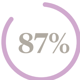
Said their pet helped them cope