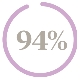
Said their animal had a positive impact on the family