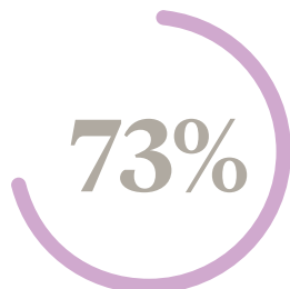
Said their pet helped them stay active and fit