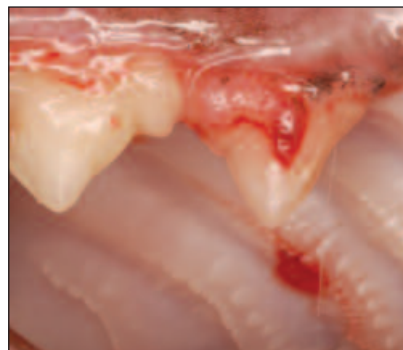
A feline odontoclastic resorption lesion (FORL).

The study found a significant correlation between feline retrovirus infection and oral disease. Based on these results, practitioners should begin to incorporate retrovirus testing into their oral health protocols—specifically, testing cats for feline leukemia virus (FeLV) and feline immuno-