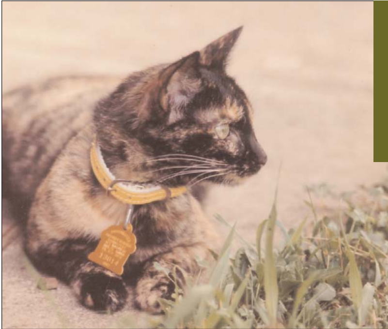
Photo 4: While many cats are infected with one or more Bartonella spp., clinical signs are not always apparent.