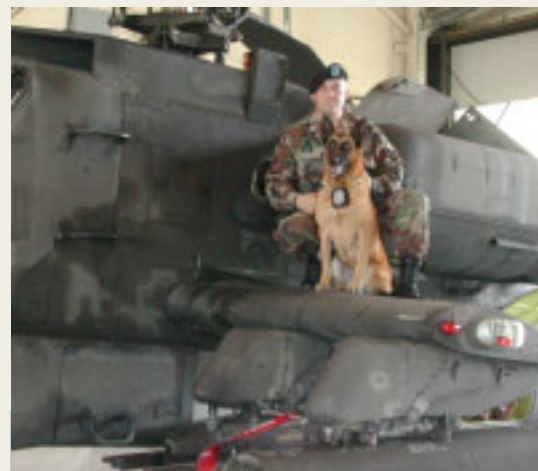
A military working dog and trainer who served during Operation Enduring Freedom.

For more information about how you can support the U.S. War Dog Association and Operation Military Care K-9 efforts, visit www.uswardogs.org .