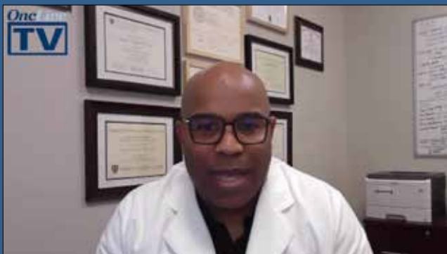
Gregory Vidal, MD, PhD

“We need to stop thinking [there is a] one-size-fits-all [solution] and be able to tailor our drug and treatment [approach] to particular [patient] populations.”