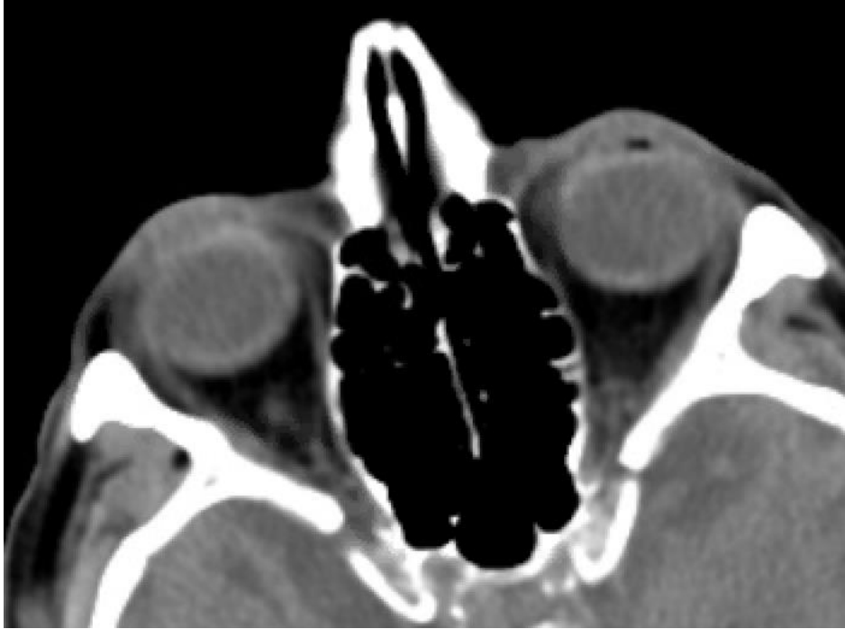
Figure 2: Axial CT scan from 5 years prior to presentation demonstrating