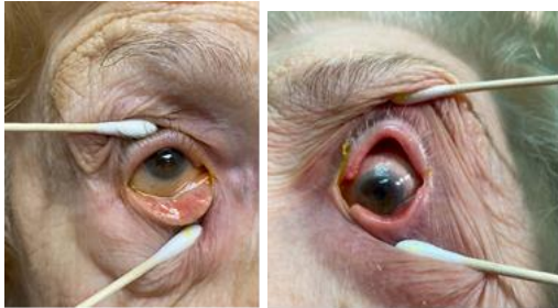
Figure 3: External photographs of the bilateral eyes at eight weeks from initial presentation demonstrating much improved conjunctival injection and resolved discharge. You can still appreciate the deep fornices and eyelid laxity.