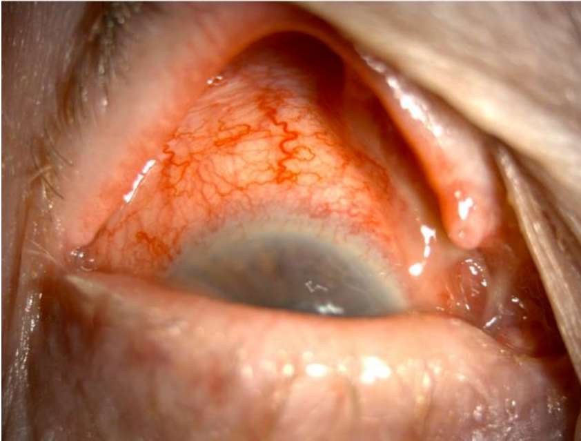
Figure 1: External photographs of the right eye at the time of initial presentation demonstrating deep fornix, diffuse conjunctival hyperemia, and purulent discharge