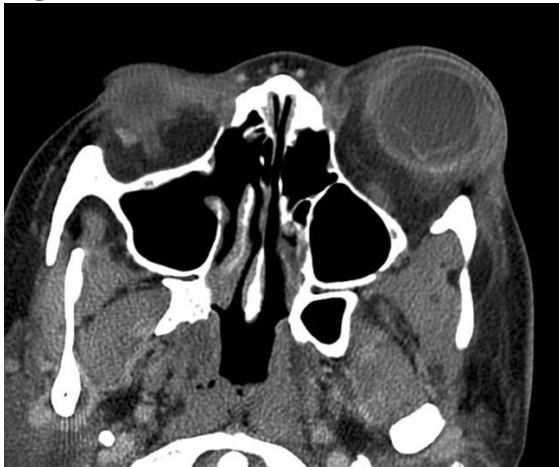
Figure 1. CT orbits upon presentation. CT orbits demonstrated thickening anterior to the left globe, thickening of the wall of the left globe, low density material between the retina and globe wall, and thickening of the optic nerve which were concerning for preseptal cellulitis, scleritis, panophthalmitis, serous retinal detachment, and optic nerve edema. No postseptal abscess was present.