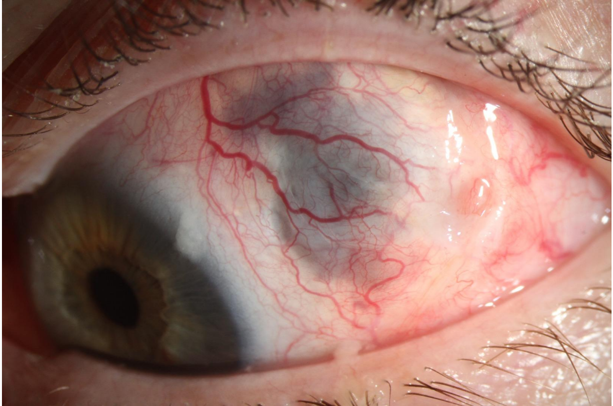
Figure 2: Slit lamp photography of the left eye after treatment for mycobacterium scleritis demonstrates resolution of the temporal scleral nodules with improvement in the conjunctival hyperemia and stable scleral thinning.