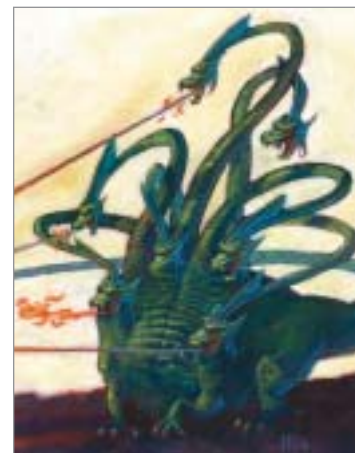
Prevailing notions about pharmacogenomics are mostly myths, page 70.