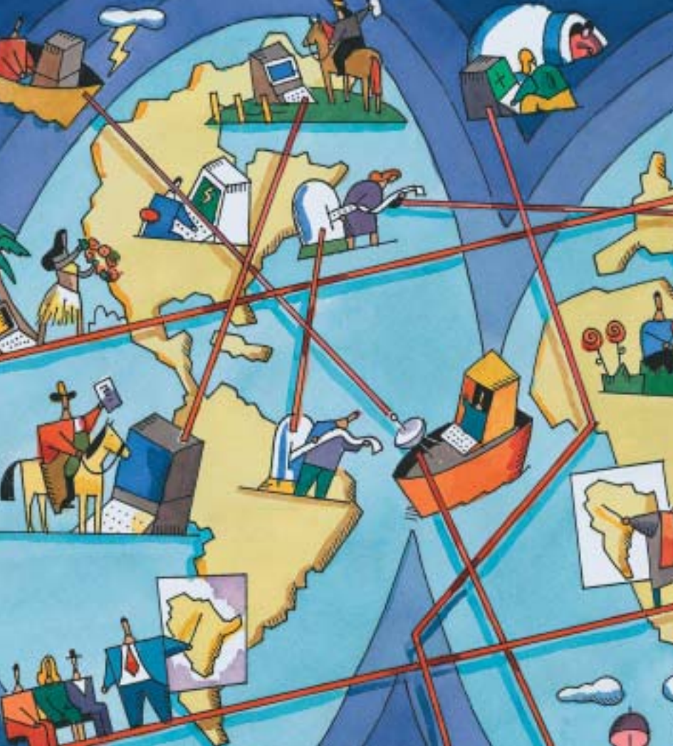
Site Selection, page 54