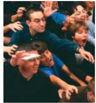
Pharma can "pull in patients" with good recruitment practices, page 64.