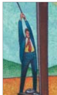
Maggon, page 60.