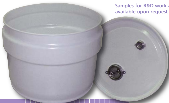
Samples for R&D work are available upon request

Vitamin E TPGS is not classified as a dangerous good.