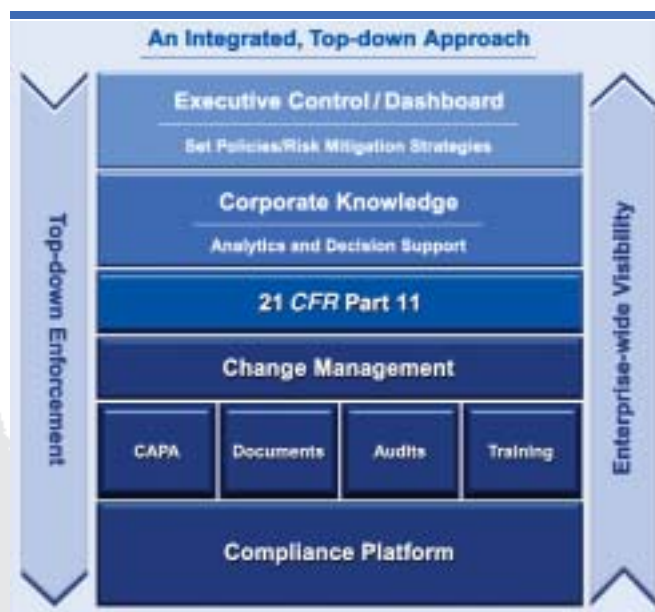
Figure 1: An integrated IT solution can increase management control.

Another example is an exception that occurs in product development. An enterprise-wide system incorporating CAPAs could uncover a deficiency in training that caused this specific