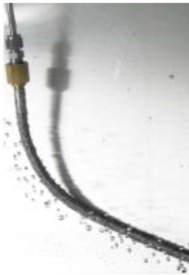
Figure 2: Small molecules such as helium and hydrogen can diffuse through flexible tubing. This photo shows a flexible pigtail pressurized with 2000 psig of helium after 5 min. under water.

site gas delivery systems are introducing impurities, which would be like drinking clean water through a dirty straw. For example, improper piping, regulators, or other equipment in the laboratory can be a source of contaminants. Several general guidelines can be followed to avoid introducing impurities on-site.