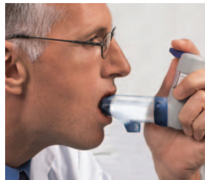
Vu-Stat Y-20 (CYRO Industries)