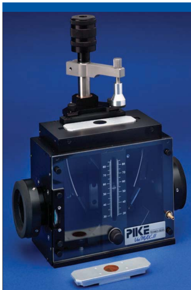
Figure 1: VeeMAX II with Single Reflection ATR Crystals.

Samples were placed face down onto the ATR crystal and no purge loss occurred when samples were changed. The VeeMAX ATR crystal employed in these measurements was 20 mm diameter and the accessory had an easily accessible sample area for analysis of small or large samples.