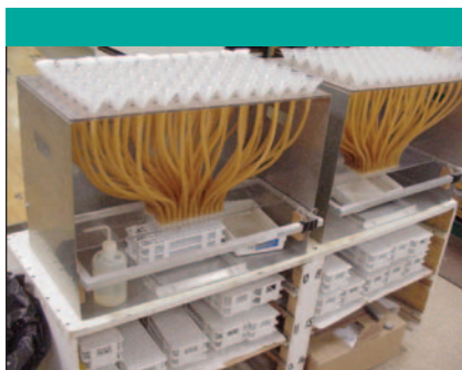
Figure 4: The "Medusa" filtering equipment.

Connecticut). This instrument has been described in the literature (7). It utilizes a dual-view (axial and radial), thermostated echelle optical system utilizing a segmented-array, CCD design. The major benefit of this optical configuration for soil analysis is that not only can the low-UV elements (such as sulfur and phosphorus) and the visible-range elements (sodium and potassium) be determined simultaneously, but the background correction points can be measured at the same time also. This allows for faster analysis times than traditional simultaneous technology, which must measure background points separately from the analyte emission lines. An additional timesaving benefit over conventional instrumentation is that the integration time for each analyte can be optimized based upon the intensity of the analytical signal — shorter measurement times for high concentrations and longer times for low-level analytes. Another important aspect of this approach is that the sample compartment is separated from the torch box to improve the long-term stability of operation. Stability is especially important for this laboratory to obtain the necessary sample throughput, without