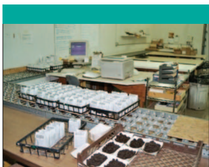
Figure 2: Sample receiving area showing the soil samples being transferred from sampling bags into paper "meat" trays positioned in a drying rack.

ity-management program, in which many soil samples are taken over a pre-defined area of the land at a time of the year when the crops are not planted.