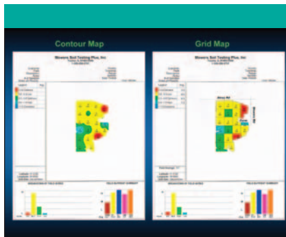
Figure 1: A typical contour and grid map of a farm in the midwest region, shown by distribution of the soil pH (pH Legend: red: < 5.8 ; yellow: 5.8–6.3; green: 6.3–6.8; blue: 6.8–7.5).

One of the most demanding applications for ICP-OES with regard to sample workload can be found in the testing of agricultural soils. Unlike environmental testing labs, which are concerned primarily with measuring toxic contaminants in the evaluation of solid waste (3), the agricultural community is interested mainly in the soil's elemental nutrients. This application can generate hundreds of thousands of