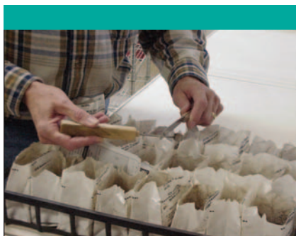
Figure 3: The soil sample is scooped up out of the bag, tapped three times with the spatula, and then leveled off, ready to be placed into a flask for extraction.

these two techniques have been summarized previously. An additional disadvantage of flame AA was that it struggled to determine elements like sulfur, phosphorus, and boron, so they had to be determined by using alternate techniques. Therefore, in a high workload environment, the use of AA was very time consuming and labor intensive, which translated into a higher cost of analysis for the client. On the other