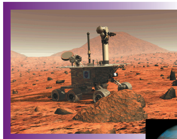
Above: This artist's rendering shows a side view of NASA's Mars 2003 Rover as it sets off on its exploration of the red planet. The rover is scheduled for launch in June 2003 and will arrive at Mars in January 2004 with an airbag-shielded landing shell.