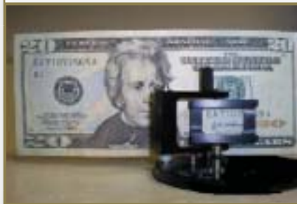
Figure 2. Jasco solid sample holder with a $20.00 bill.