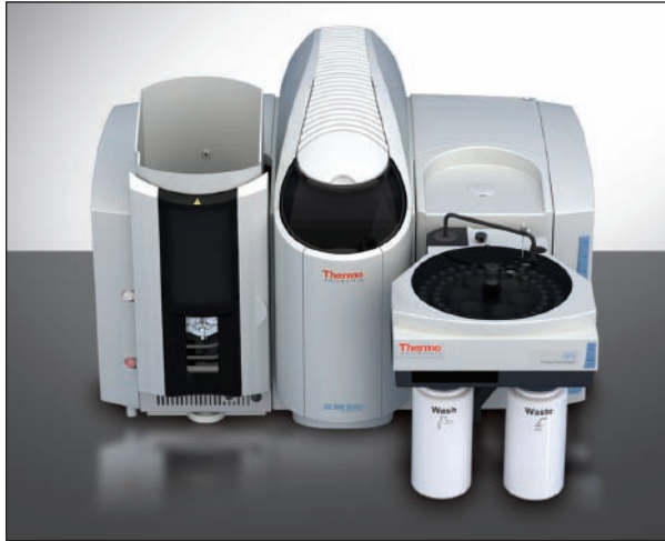
Figure 1: Complete Thermo Scientific iCE 3500 System.

(6) Validator and Validator plus accessories enable systems to be validated as part of a regulatory compliance programme.