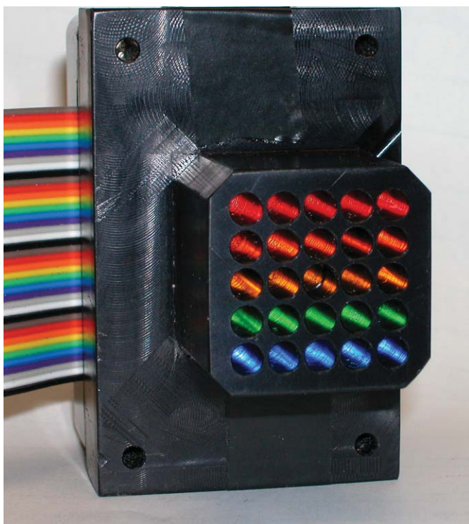
The SEARCH laser head prototype, shown here filled with visible light diodes. The diodes plug in and are easily replaceable with near-IR wavelengths.

designed to be light enough to be mast-mounted on a Mars rover where it then will have a useful target range of up to 10 m. This will allow SEARCH to make a detailed spectral portrait of the landing area and any suspected localized biohabitats could be analyzed from a distance. Once a habitat is detected, the rover vehicle then could drive directly over to the site and conduct further in-situ sampling and imaging. Using only 3.7 W of electricity internally supplied by the Mars rover power source, SEARCH has a laser diode array of 25 radiation-hardened low power laser diodes 5 mm in diameter with frequencies ranging from 300 to 2400 nm. The instrument is designed to work either during the Martian day or night.