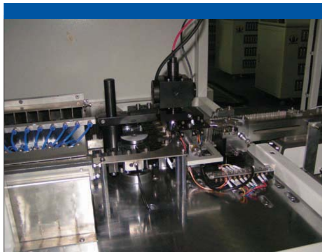
Figure 2: Spectral measurements inside the LED sorting machine.

Important aspect of this application is the speed and accuracy with which the LED's can be classified. The AvaSpec-