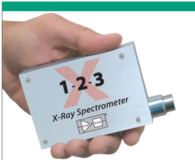
Figure 1: X-123 measures 2.7 \times 3.9 \times 1 in. ( 7 \times 10 \times 2.5 cm)

light tight, vacuum tight thin Beryllium window to enable soft X-ray detection.