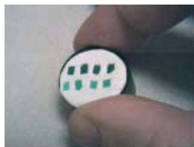
Figure 1. Placement of multiple samples & standards in sample cell, for analysis.

Each BCR 600 series "pellet" is approximately 2.5 \text{ mm}^3 , weighing ca. 10 mg. They were prepared for analysis by slicing in half, lengthwise and embedding in adhesive putty, so that the flat surface faces upward (Fig. 1). Sample material was ablated via an