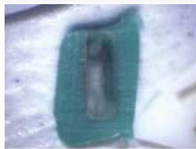
Figure 2. Image of a 800 \mu\text{m} \times 2500 \mu\text{m} line ablation in SRM BCR 610 plastic.

automated line raster (Fig. 2) measuring 800 \mu\text{m} \times 2500 \mu\text{m} with an optically imaged, square aperture. Helium sample cell gas carried the dry aerosol which was subsequently mixed with argon before entering the ICP, as described previously (4). The laser and ICP parameters are listed (Table I). The ICP-MS data was intentionally run in a reduced sensitivity mode due to the high signal level for some of the elements characterized. Other spectrometer settings (RF power and lens offsets) are not shown as it is expected that different MS systems will have different optimal settings. The carbon isotope at mass 13 was used as an internal standard for all analyses.