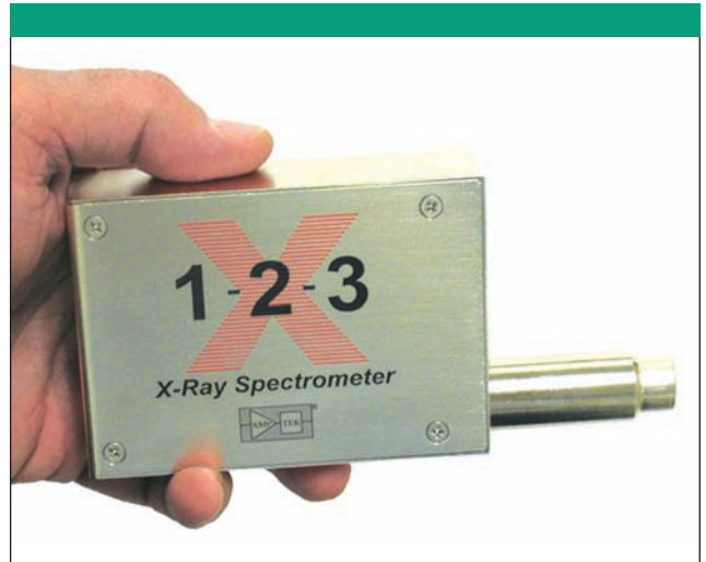
Figure 1: X-123 measures 2.7 \times 3.9 \times 1 in. ( 7 \times 10 \times 2.5 cm).

a light tight, vacuum tight thin beryllium window to enable soft X-ray detection.